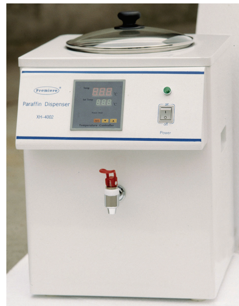
XH-4002, 2.3 Gallon Paraffin Dispenser